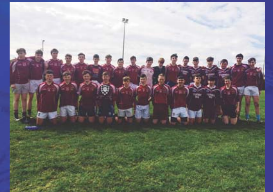
Junior Champions 2016