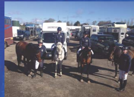
Zero Faults All Round