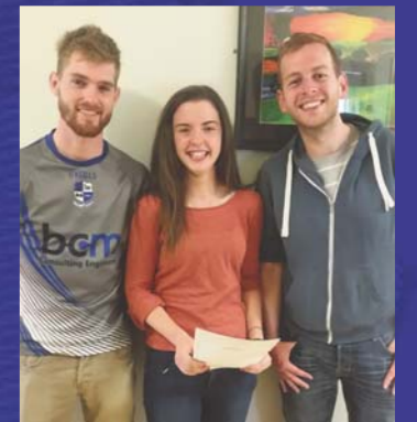
Leaving Cert Delight - Spot the Teachers!