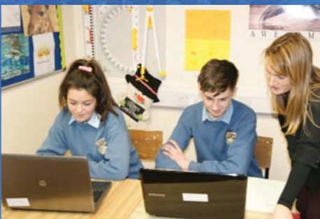
Teaching and Learning