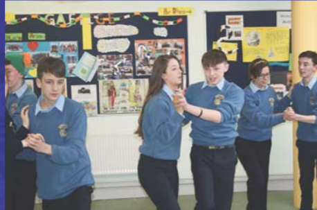
Siege of Kilbeggan