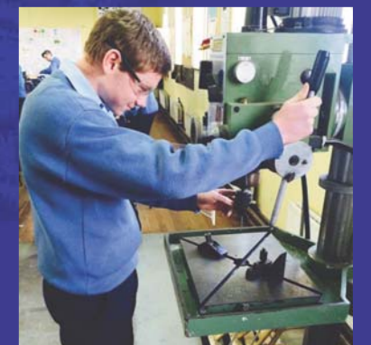
Man of Steel