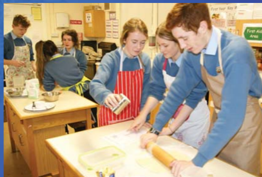
The Perfect Mix