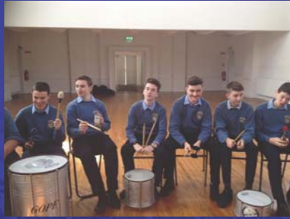
One! Two! Three! Four!