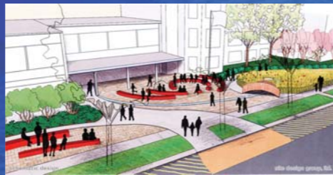
New School Horizon