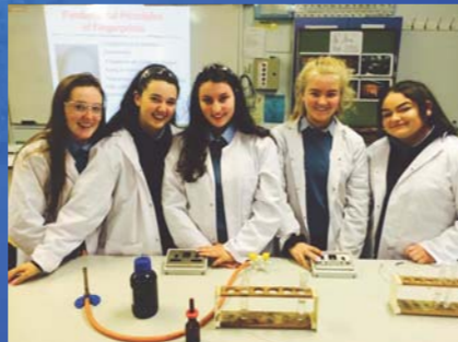
BT Young Scientists