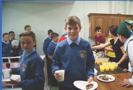
Ich Bin Ein Berliner