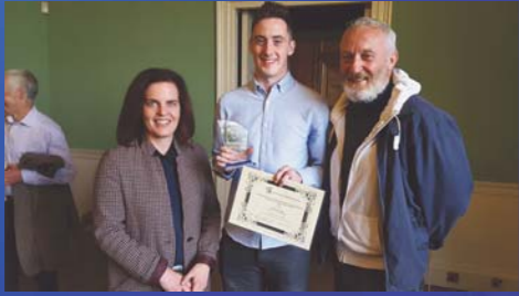
National Leaving Cert Excellence in Art