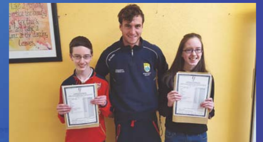
Junior Cert Joy to the Power of Two

The school operates a very successful Book Rental Scheme which helps defray the high cost of school books. The scheme is available to all students.