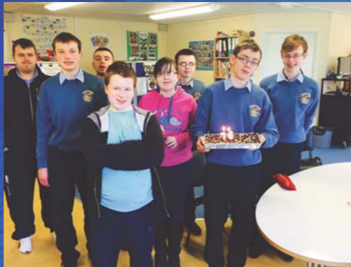
Happy Birthday to Us!