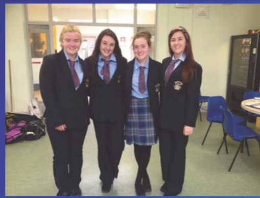
Debating Team Wordsmiths

A comprehensive Remedial Education Programme is offered in both Mathematics and English. This programme is offered to students in a small group setting. The programme also involves ongoing consultation and co-operation between teachers, parents and relevant agencies within the Department of Education and Science, as appropriate.