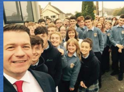
Raising the Green Flag